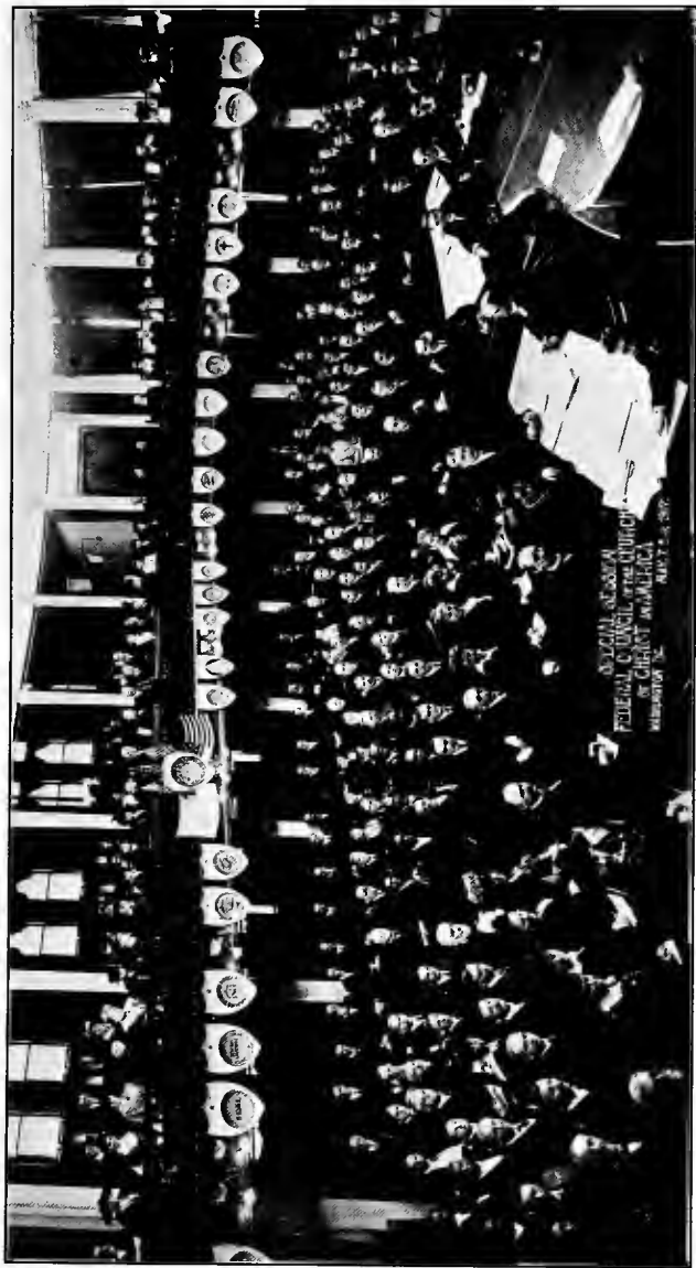
American religious bodies in conference at Washington